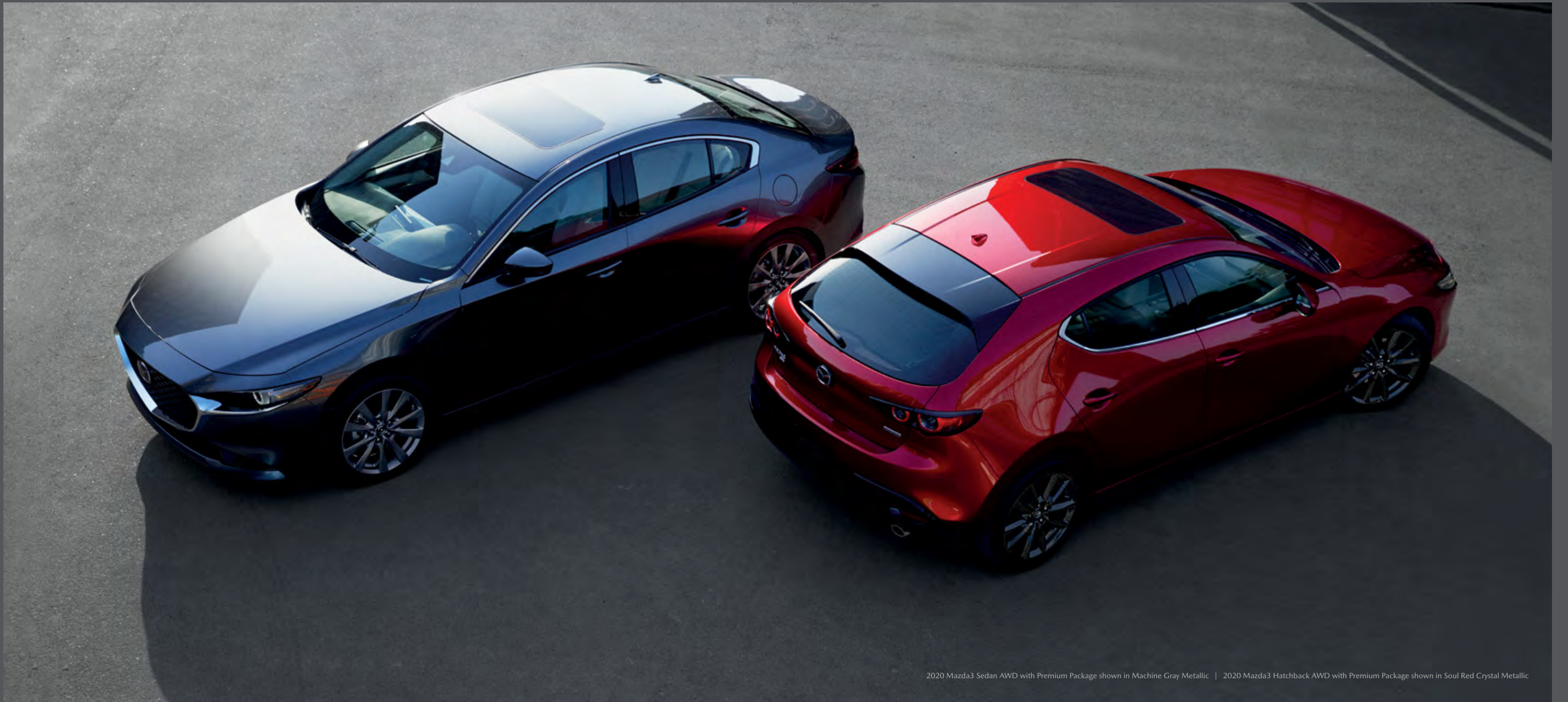
2020 Mazda3 Sedan AWD with Premium Package shown in Machine Gray Metallic | 2020 Mazda3 Hatchback AWD with Premium Package shown in Soul Red Crystal Metallic